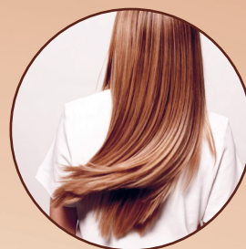
MOISTURISE + BRUSHING